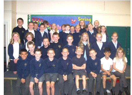
Stars of the week—