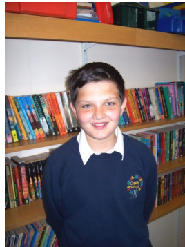
This weeks support staff nomination winner —