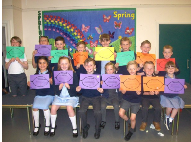
This weeks Earth Award winners