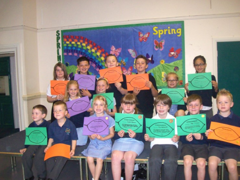
This weeks Earth Award winners

head/admin/clerical@copley.calderdale.sch.uk