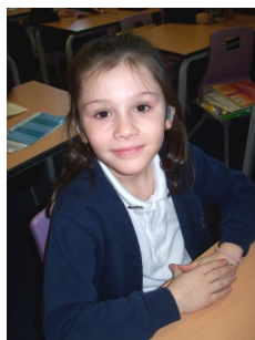
Support Staff Nomination Winner