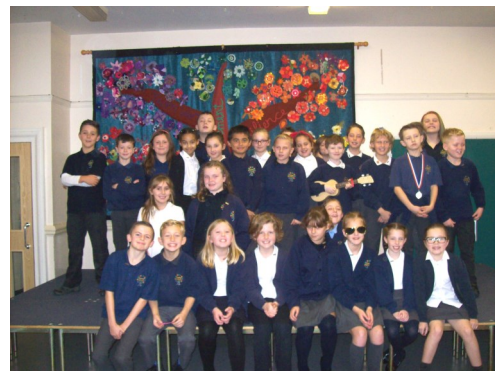
Stars of the Week