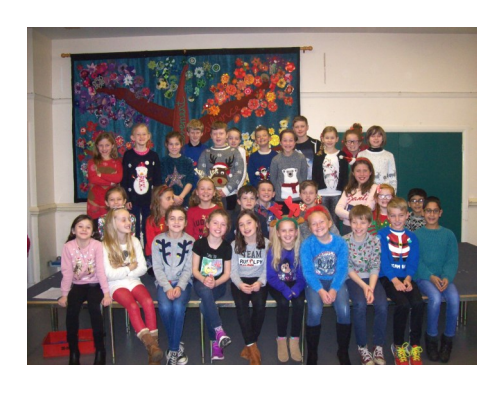
Stars of the Week Calder