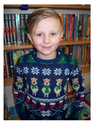
Support Staff Nomination Winner