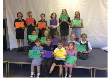
Stars of the Week