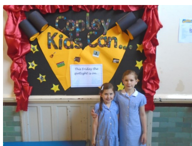
These sisters certainly Can Do!!