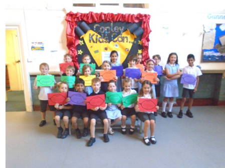
This weeks Earth Award Winners